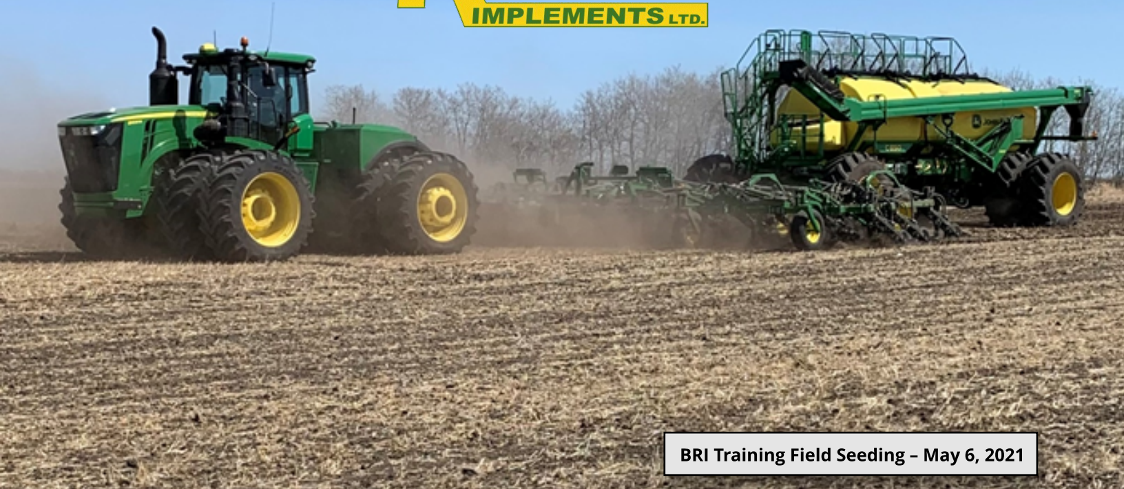
BRI Training Field Seeding - May 6, 2021